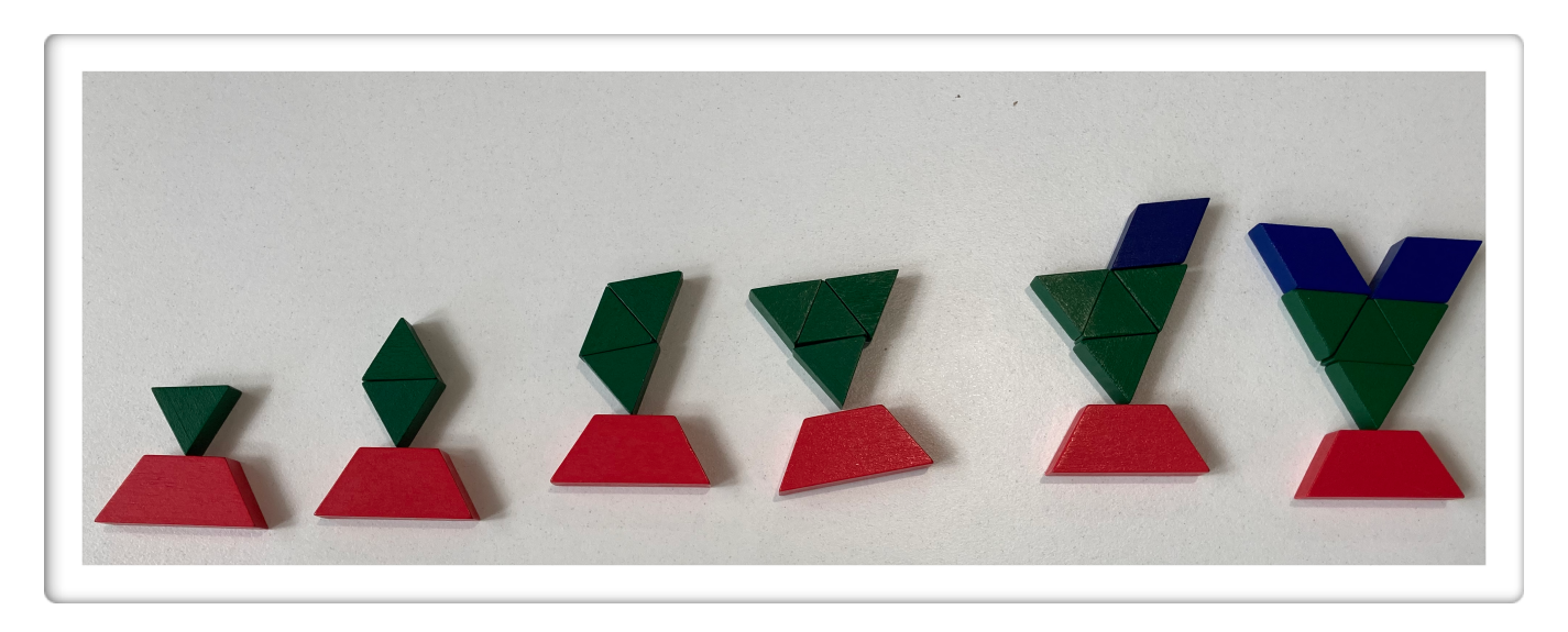
Copyright © 2022 Australasian Problem Solving Mathematical Olympiads (APSMO) Inc. All rights reserved.