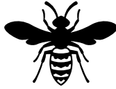
Bee (or Wasp)